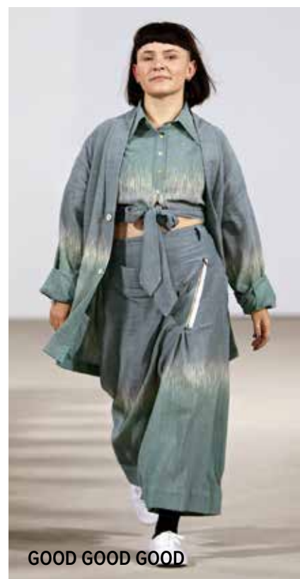
GOOD GOOD GOOD